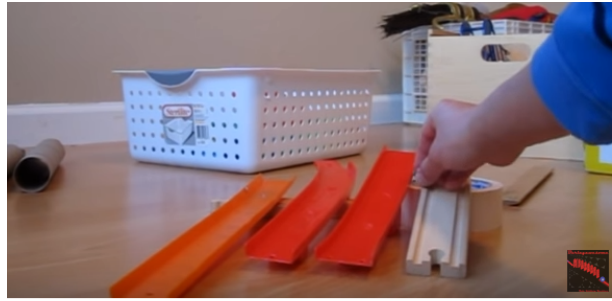
How to Make a SIMPLE Rube Goldberg Machine - Become a Beginner

https://www.youtube.com/watch?v=PK2_gA2OeMI