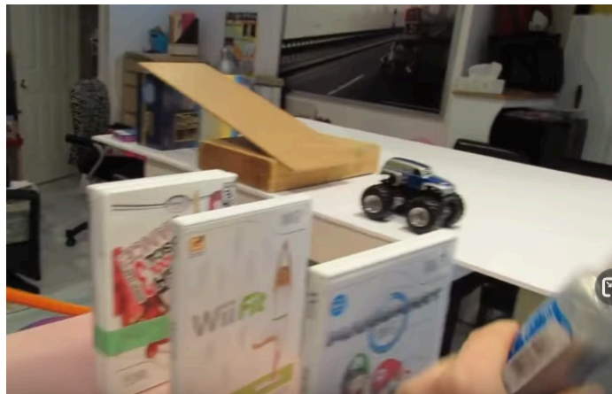
Physics -Rube Goldberg

https://www.youtube.com/watch?v=PK2_gA2OeMI